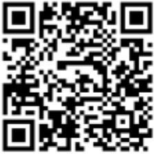
Grapevine Flag Football