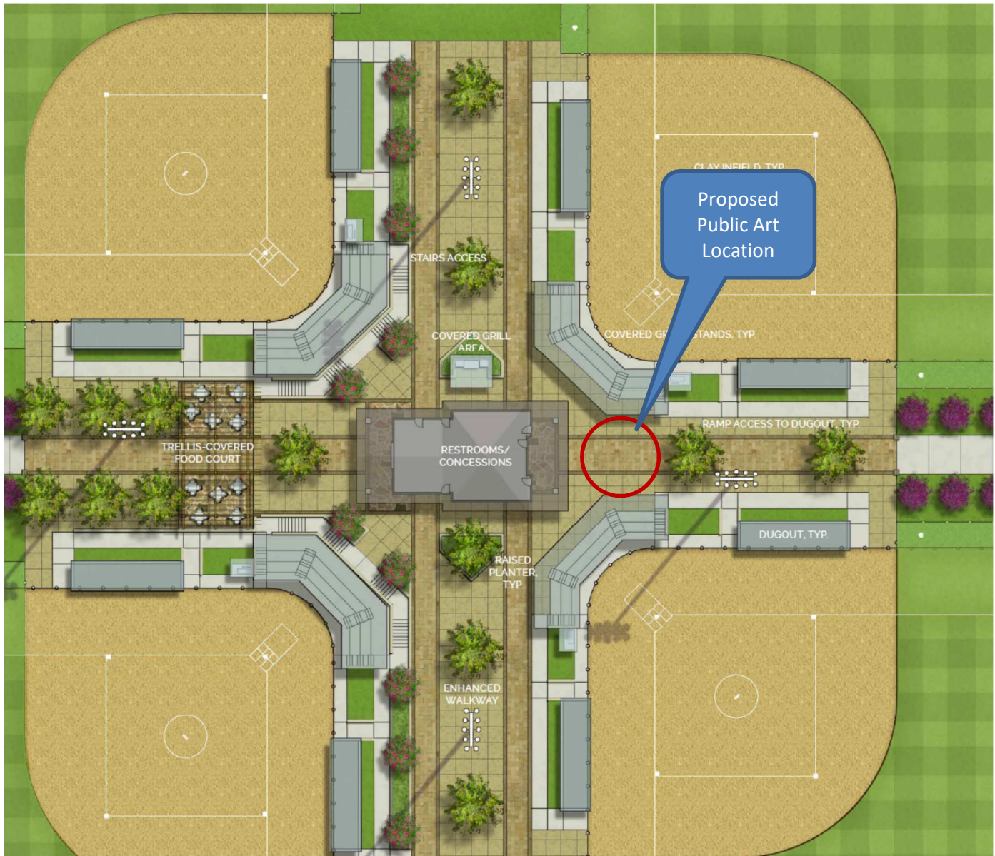
CENTRAL SPECTATOR / PEDESTRIAN AREA